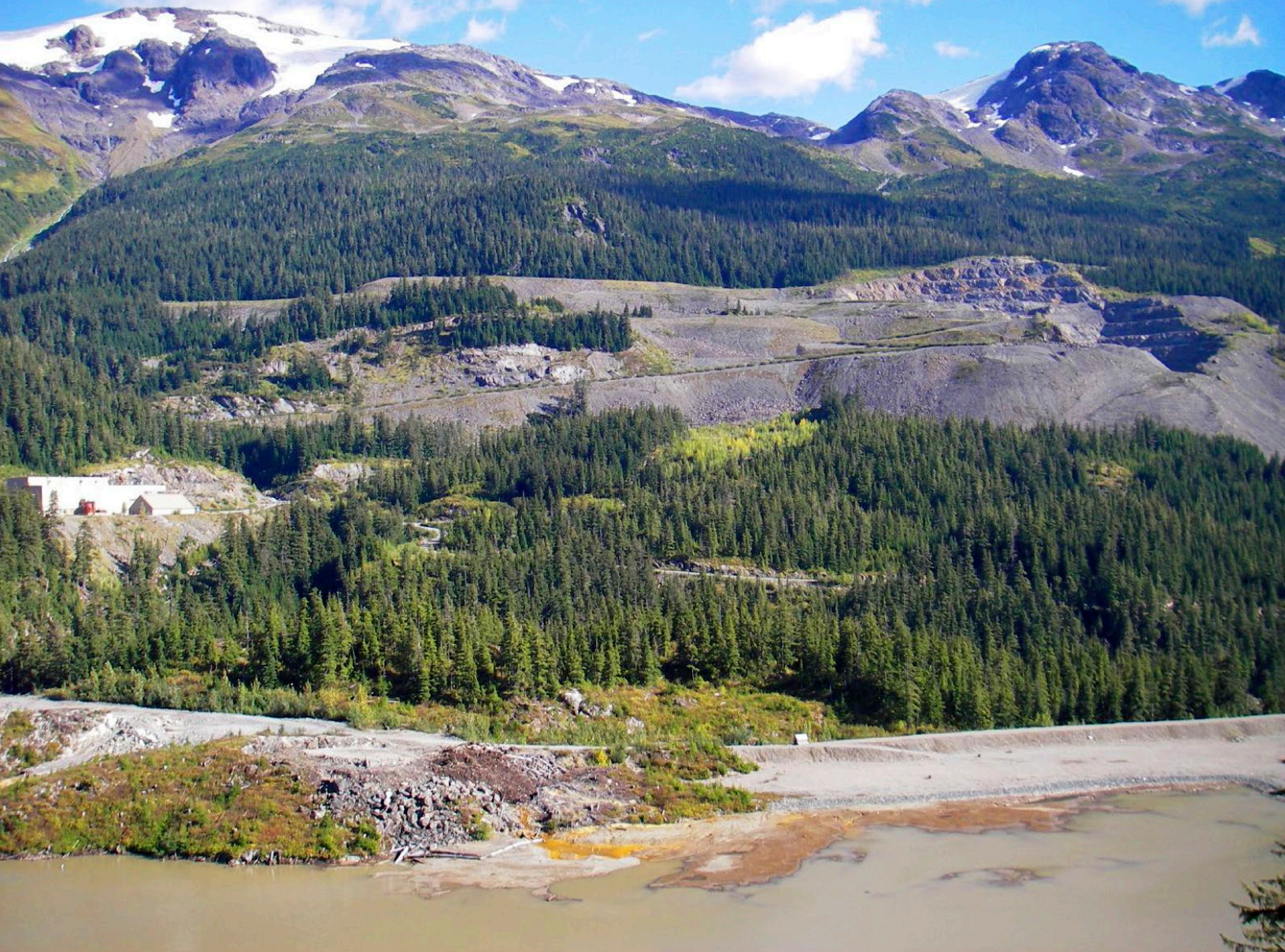
PREMIER MINE, B.C.